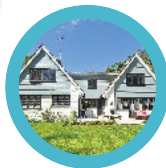
Hostels and Guesthouses